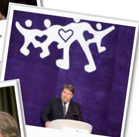
Lord Strathclyde gives the keynote address