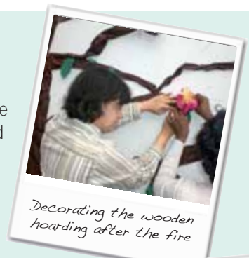
Decorating the wooden hoarding after the fire

The fire damaged area of the garden has had to be kept securely boarded up as the soil is badly contaminated with shards of glass and metal. The wooden hoarding has provided Kisharon with a wonderful expanse of pristine white space that was decorated during our Volunteers Thank You and Raffle Draw Party.