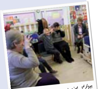
Youth Leaders visit the Kisharon Day School

Whilst visiting the Day School the youth leaders joined pupils in fun filled games as they learnt about Purim. The youth leaders were able to witness firsthand the supportive and loving environment that Kisharon offers helping students to reach their potential, both academically and socially.