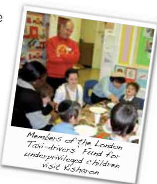
Members of the London Taxi-drivers' Fund for underprivileged children visit Kisharon