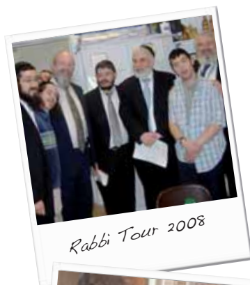
Rabbi Tour 2008

5-a-side football tournament Date to be confirmed