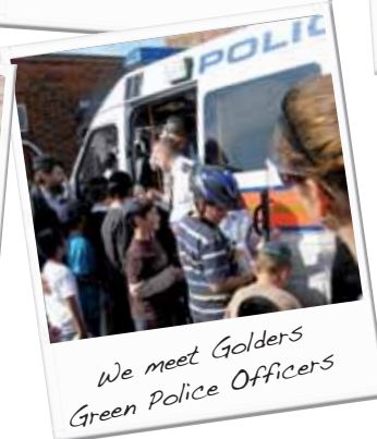
We meet Golders Green Police Officers