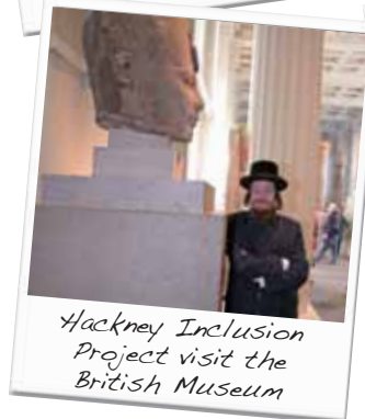
Hackney Inclusion Project visit the British Museum